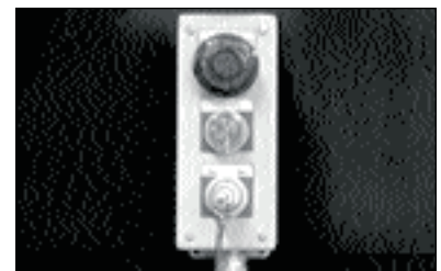
Remote Control (Shown with an Optional Advance Full Load Indicator)