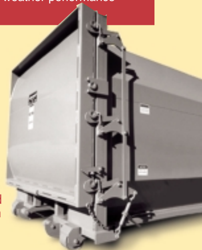
"Bubble Gate" and "Auto Relatch"

The ultimate in latch systems, Marathon's "Auto Relatch" eliminates the need to hold door while operating the latch ratchet. The design allows operator to use both hands on the ratchet.