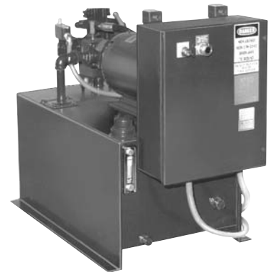
Remote Power Unit